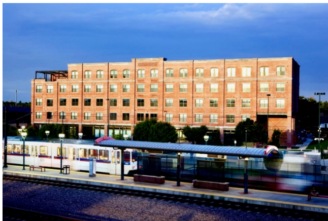
Top Left: Avondale Apartments | 80 units of affordable rental housing on Colfax Avenue developed in partnership with Del Norte Top Right: Park Hill Station | 156 units of affordable rental housing on the A Line Commuter Rail developed in partnership with Delwest Bottom Left: Evans Station Lofts | 50 units of affordable rental housing on the Southwest Rail Line developed in partnership with Medici Consulting Group

Despite these successes, we and our affordable housing partners are unable to mitigate the massive shortfall in Denver's affordable housing needs. According to Exploring Colorado's Housing Affordability Challenges in All of Their Complexity , the latest study published by Shift Research Lab and Colorado State University, "housing unaffordability is becoming the most significant threat to family economic security in Colorado." 3